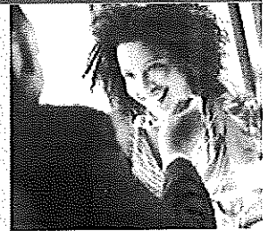
Paid professionals. Not actual patients.

LASIK is one of the most popular elective procedures on the market today. Enjoy the freedom of LASIK!